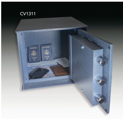
Three large 1" bolts in boltwork