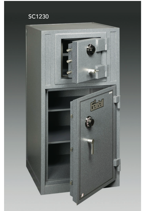
Safe/Chest Combo TL15 Chest with 2 Hour Fire Safe below

Designed for complete protection of your valuables, a “B” rated burglary safe securely welded inside a 2-hour fire resistive safe.